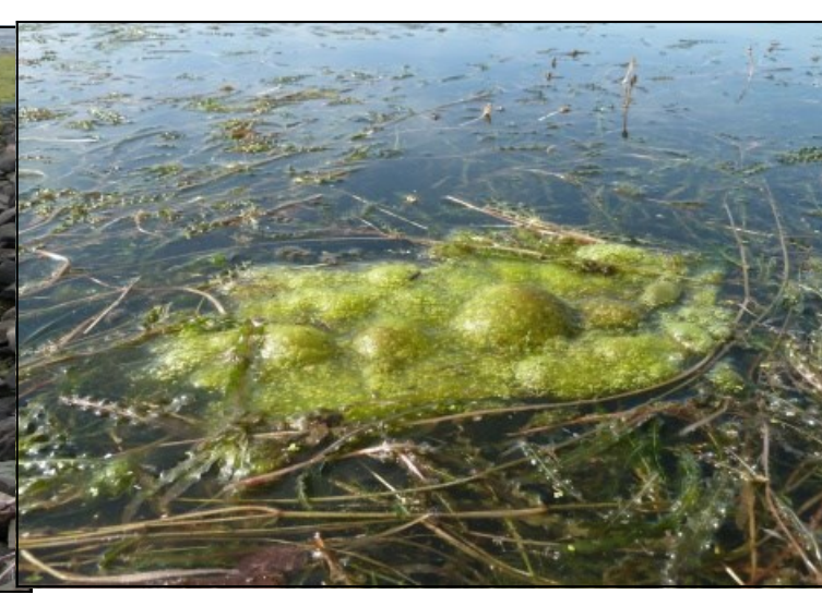
Green algae can look like bubbling scum on the water and may be entangled with other plant material, but do not produce harmful toxins.