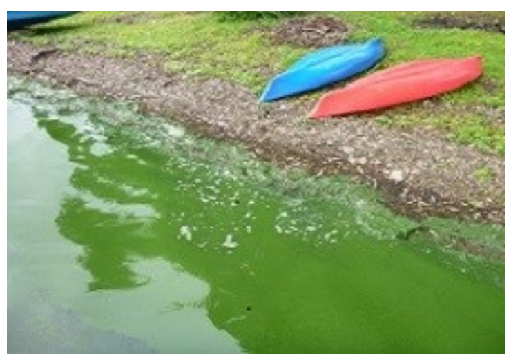
HABs may have the appearance of pea soup