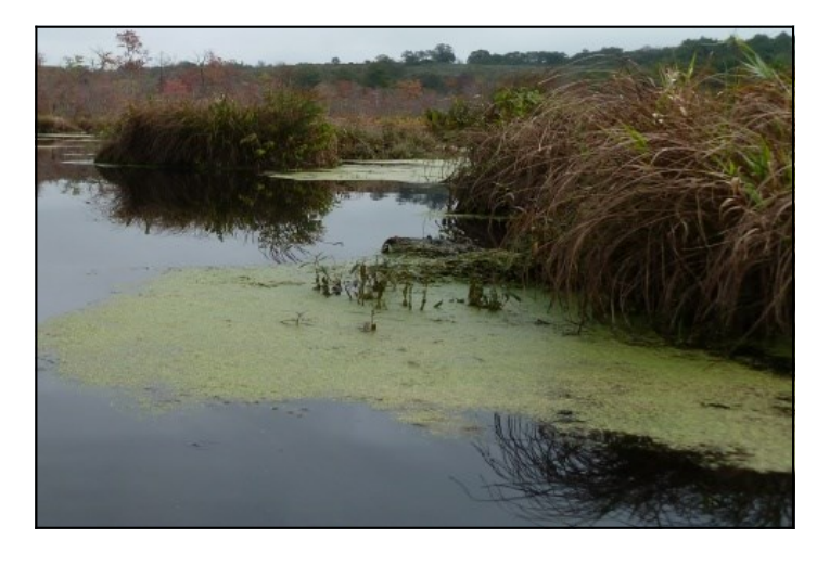
Green algae can form thick mats on the water surface but do not produce harmful toxins.