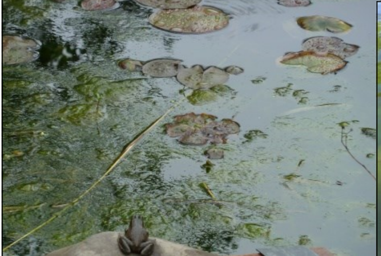
Green algae can look silky, hairy or like wet fabric on the rocks, plants or water surface, but do not produce harmful toxins.