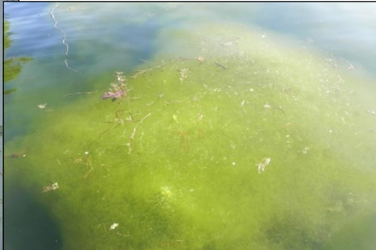
Green algae can look stringy or hairy or like a tumbleweed in the water or on the lake bottom, but do not produce harmful toxins.