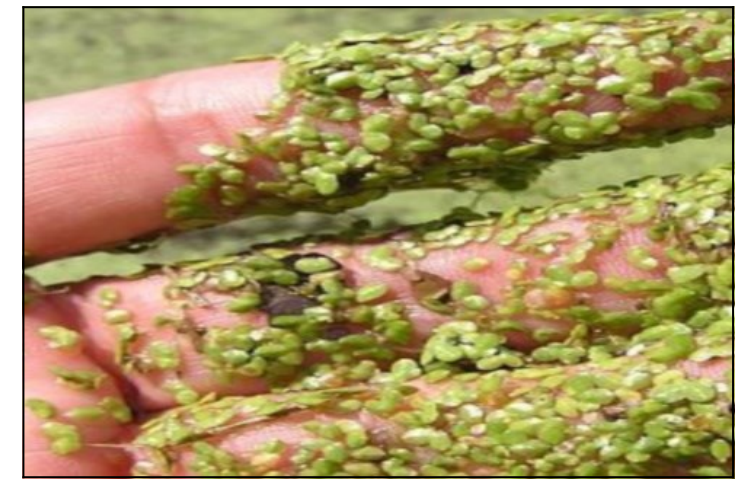
Although duckweed can cover the water surface, it is not algae, and does not produce harmful toxins. It is a tiny aquatic plant with a grainy texture and looks like a miniature lily pad.