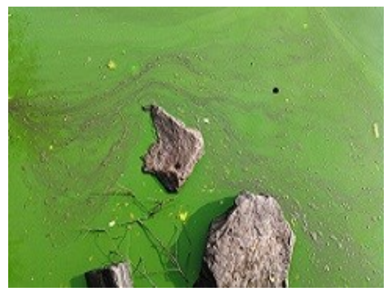
Algal blooms may have the appearance of spilled green paint