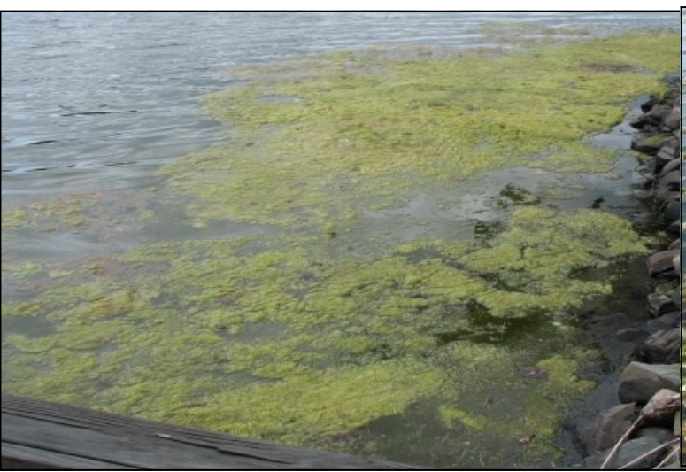
Green algae can look like floating rafts on the water, but do not produce harmful toxins.