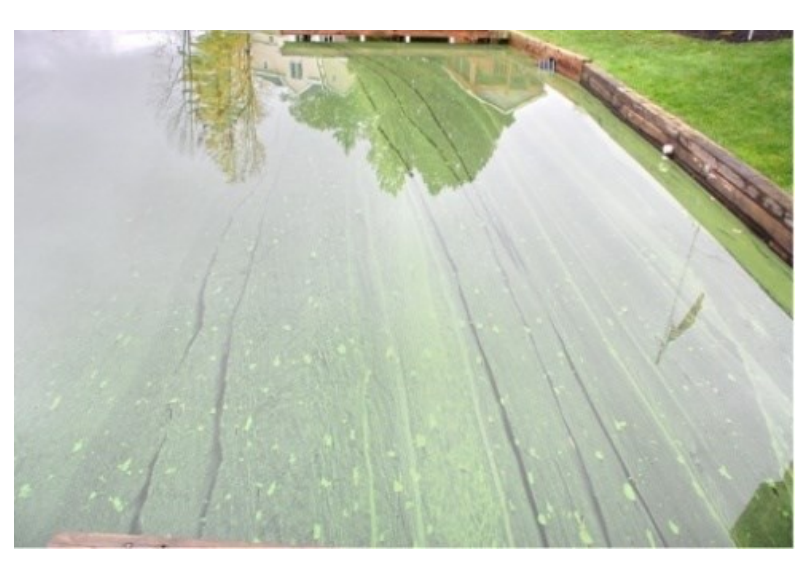
HABs may look like parallel streaks, usually green, on the water surface.