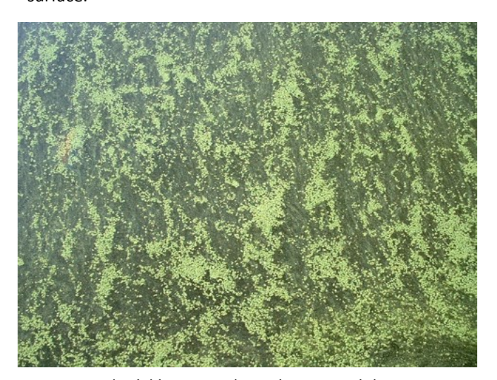
HABs may look like green dots, clumps or globs on the water surface.