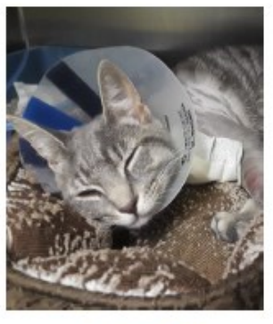
MICKEY FRACTURE-HUMERUS NY SAVE ASSISTANCE $531.45