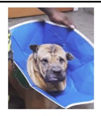
ENVY ATTACKED BY DOG-FRACTURE NY SAVE ASSISTANCE $1500.00

The variety of medical issues is striking, and have included a puppy who jumped from his owner's arms and broke both front legs, an elderly dog with a bleeding spleen, a dog hit by a car, and a cat who fell from a window in a high rise building. See some of the faces or the cases below.