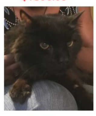
NINJA RENAL FAILURE NY SAVE ASSISTANCE $1250.00