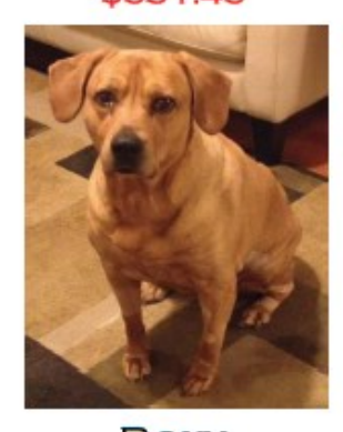
ROXY SPLENECTOMY NY SAVE ASSISTANCE $1000.00

THANKS TO OUR WONDERFUL NETWORK OF DONORS, WE ARE ABLE TO CONTINUE TO SAVE ANIMALS IN VETERINARY EMERGENCY